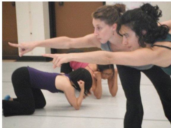
Luna Dance & Creativity