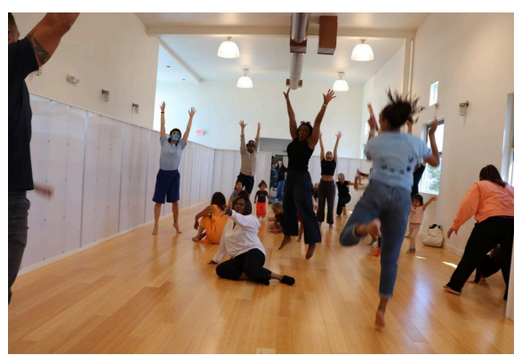
Luna Ribbon Cutting Family Dance

dance. They make meaning, communicate, create, and express through their art form. The children and youth in Luna's Studio Lab program do the same. Children's natural propensities to learn through movement, curiosity, and imagination are honored."