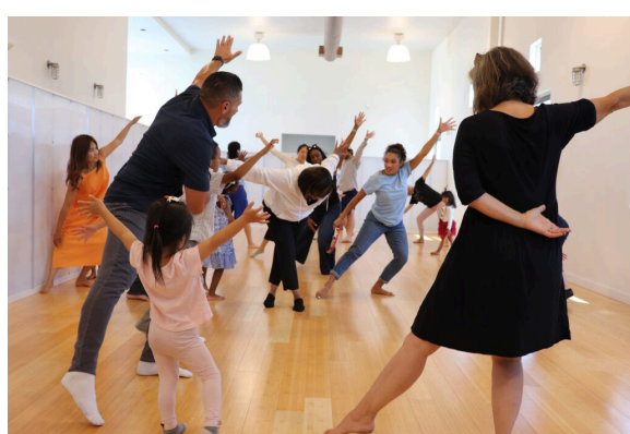
Luna Dance & Creativity Family Dance

programs include Studio Lab for children, teens, families and adults to engage in self-exploration and collaboration; Professional Learning which aids artists and teachers throughout all stages of their creative journeys; Field Moving , a program that motivates artists to bring people together in their communities; Partners for Change includes Moving Parents and Children Together (MPACT); Early Childhood focusing on early childhood dance and so much more.