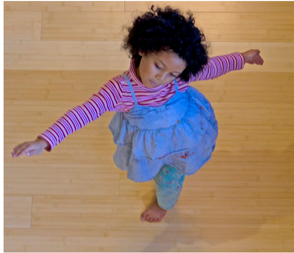
Luna Dance & Creativity – open shape